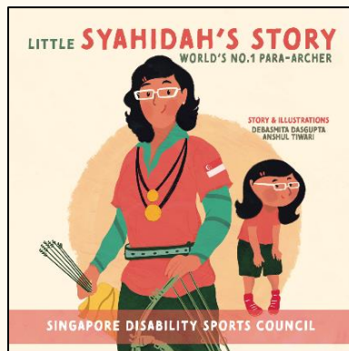
Beginner book (suitable for aged 6 and below)

If you would like to have a physical copy of the book or to gift it to a friend, you can now order the book HERE .