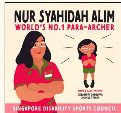
Early reader (suitable for aged 7 to 12)