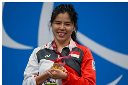
TeamSG Swimmer Yip Pin Xiu at the Victory Ceremony at the Tokyo Paralympics Games.

Even though our athletes had to adapt to a very different Games as compared to previous years, TeamSG gave their very best to qualify for the Olympiad and put up strong performances in Tokyo 2020.